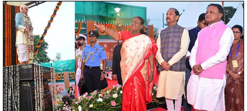
President Droupadi Murmu unveiling the statue of Pandit Raghunath Murmu at Niladri Vihar, Bhubaneswar on 3 December 2024. Governor Raghubar Das and Chief Minister Mohan Charan Majhi and Ministers of Odisha Govt are present.

Patnaik International Airport. Soon after her arrival, the President unveiled the new statue of Pandit Raghunath Murmu, an eminent Santali writer and educator at Niladri Vihar in Bhubaneswar. She also visited Adim Owar Jarpa Jaher in Bhubaneswar, offered prayers and interacted with the local tribal families. GNR